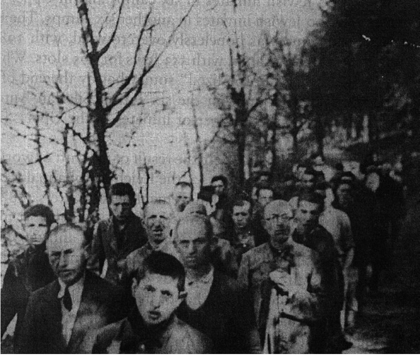
9.2 Forced labourers, likely from the Litzmannstadt Ghetto, on their way to or from work near the Kreuzsee Bei Reppen labour camp.

and its enormous army stretched this capacity to the limit. In the winter of 1942, the promised food dividend from the invasion of the Soviet Union and the capture of its fertile lands did not materialize, especially with the “scorched earth” strategy that the Red Army employed, burning crops as they retreated rather than leaving them to their enemy. Feeding millions of prisoners of war, people in forced labour camps like Kreuzsee Bei Reppen and in Ghettos like Litzmannstadt became impossible. Working them to death was the resulting solution, which became policy. 5