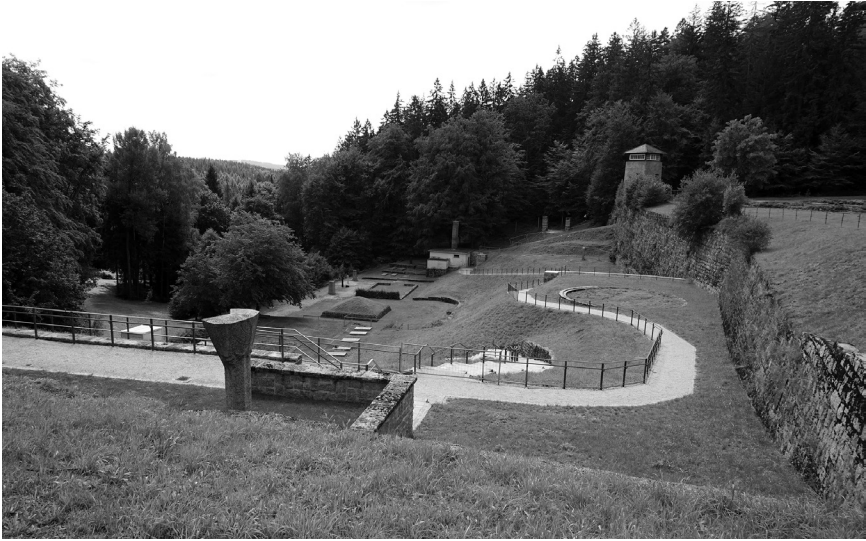
14.2 Part of the grounds of the Flossenbürg concentration camp. The small building at the rear is the crematorium.

himself to be Dachdecker (roofer). Knowing the damage caused by the Allies' air raids to cities, his invented skill, he hoped, might be in high demand. Also, it might entail working alongside civilians, which would mean extra food. 6 The seemingly organized reception did not match the place's conditions, which as in Gleiwitz were horribly chaotic. Thousands of prisoners had arrived from camps in the advancing Red Army's path in the preceding weeks and months, so the camp was crowded the camp well beyond its capacity.